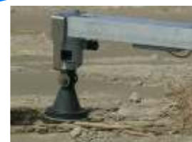
measurement in arid zone