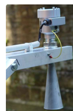
standard fixing device