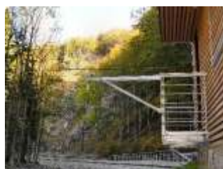
measurement of surface water