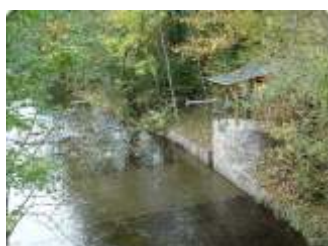
water level monitoring